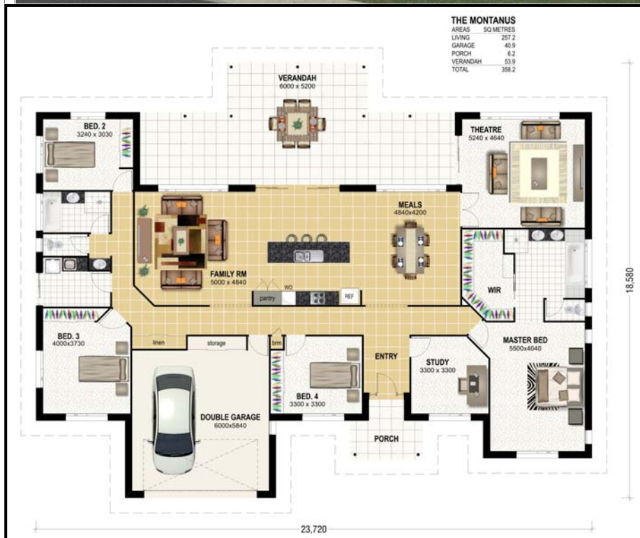
Illustration purpose only

Floor Area 358m 2 4 Bed, Study, 2 Bath Separate Living & Theatre room Double Garage